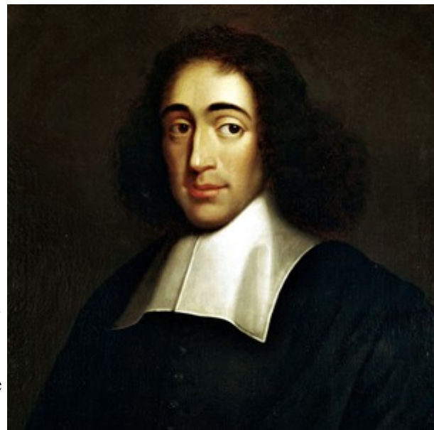
Baruch Spinoza (1632-1677)

Two influential contemporary metaphysical views are scientific reductionism , which is essentially a materialist position, and mathematical idealism , which holds that the basis of space and time is not subatomic particles, but rather, certain mathematical truths. Both positions derive from long traditions in Western thought, and both have merits. Scientific reductionism derives its force from the successes of modern science, which is itself largely a reductionist enterprise – meaning that it tends to explain the complex world in terms of layers of increasingly basic constituents. Mathematical idealism is inspired in particular by the successes of computer science in generating mathematically-based models of worlds; in fact, so successfully that the idea that our universe is itself a computer simulation produced by an advanced civilization has entered the mainstream in philosophy (see 'Are You Living In A Computer Simulation?', Philosophical Quarterly , 53(211), Nick Bostrom, 2003).