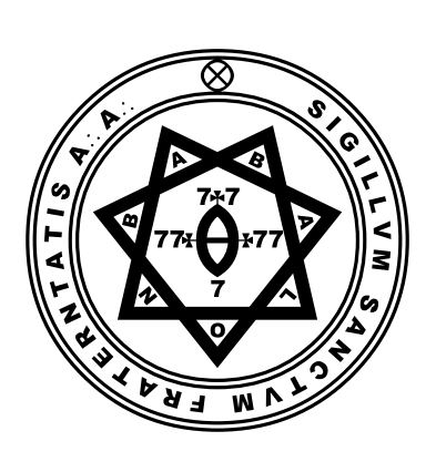
A::A: publication in Class B